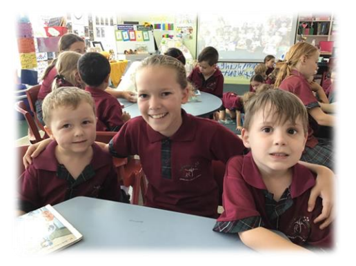
Prep students meet their Year 6 buddy within the first few weeks of school.

Starting school is a very important time for every child and can be very emotional for many (including parents). To ensure a smooth transition, school should be an environment in which your child feels comfortable and supported.